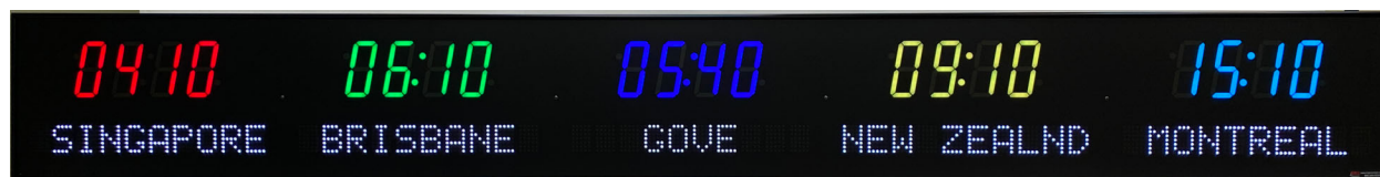
Model 6610O - 4.0" time, 2.0" zone labels, 5 zone

The 6610 series time zone clocks have user changeable multi-color bar-segment LED time displays with a ten character user changeable multi-color dot matrix digital zone label below. In many 6610 models, the clock can display up to 24 time zones through page flipping. For Example, a six zone clock can show four pages of time zone information. Likewise, a four zone unit can show six pages.